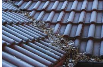
Leaves piling up on roof