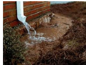
Damage to foundation