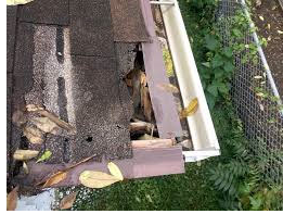
Damage to shingles