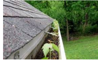
Vegetation in gutter