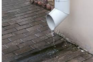
Water not being drawn away