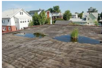
Vegetation growing on roof Stains from pooling water